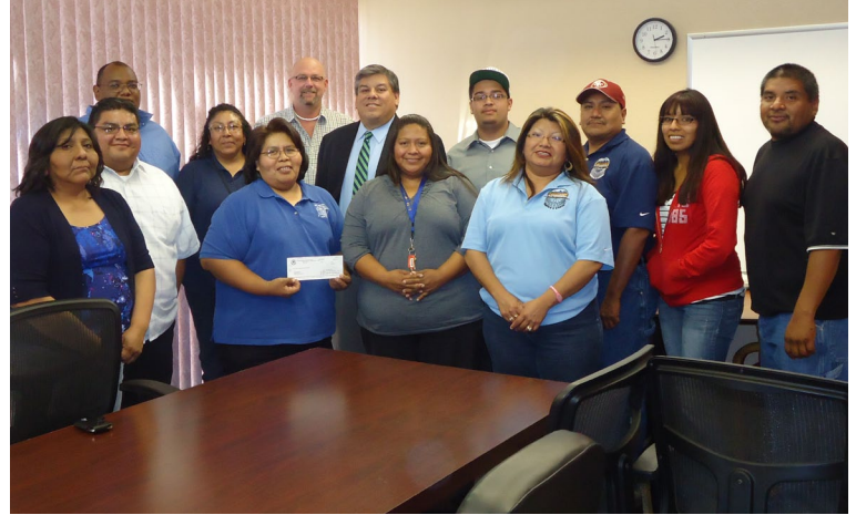
TOKA staff & Sells District Representatives for the TOKA check presentation.

Late last year, the Sells District came to TOKA with inquiries of a cost sharing opportunity. What emerged from that discussion was what we call the 50/50 Challenge Program. In this program, TOKA will match district funds $1 for $1 up to $200,000 for projects that address affordable housing. With this one-time allocation, San Xavier District was able to build four homes and Sells District assisted 35 families with repairs, indoor plumbing, roof renovations, as well as purchasing modular homes.