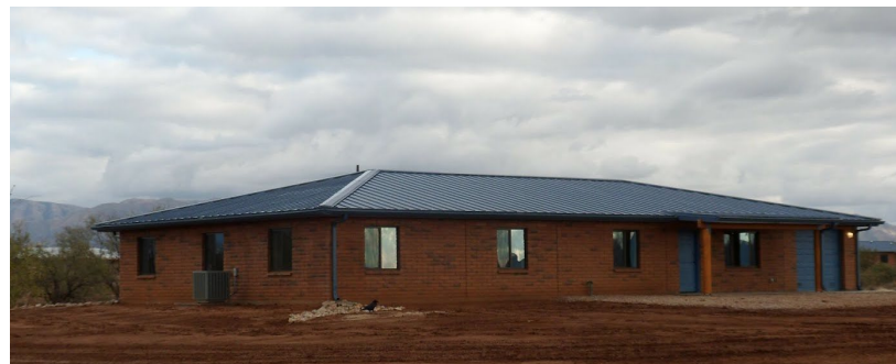
One of many newly developed homes, South Komelic project